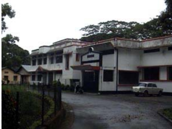
Phanidhar Datta Memorial Hall