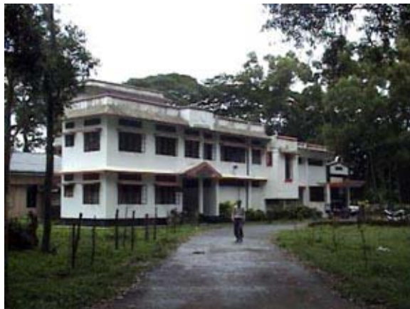
Phanidhar Datta Memorial Hall