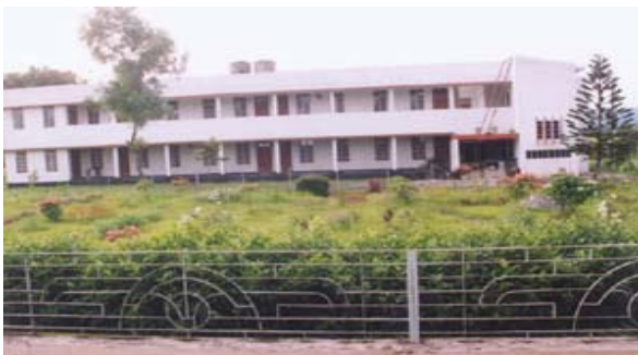
Gauhati University Guest House