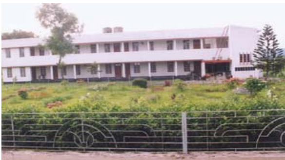
Gauhati University Guest House