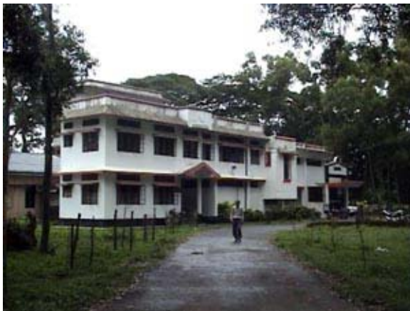
Phanidhar Datta Memorial Hall